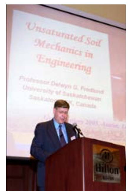
Delivering the 2005 Terzaghi Lecture, "Unsaturated Soil Mechanics in Engineering Practice," during Geo-Frontiers 2005 in Austin, Texas.

Of all disciplines in civil engineering, geotechnical engineering has the greatest need for engineers with a graduate degree because the standard four-year bachelor's degree doesn't provide sufficient training for geotechnical engineering practice. When I first graduated from civil engineering, the general thinking was that postgraduate M.Sc and Ph.D. degrees were requirements for people interested in academic positions. But today, consulting firms commonly