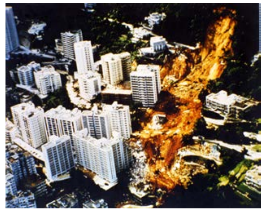
Po Shan landslide on Hong Kong Island in 1972.

During my university career, I traveled to developing countries and saw the extreme needs there, and wondered if I could be helpful in some way.